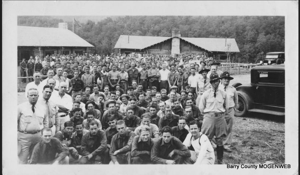
Barry County MOGENWEB

Several buildings remain standing, showing the military style layout of camp.